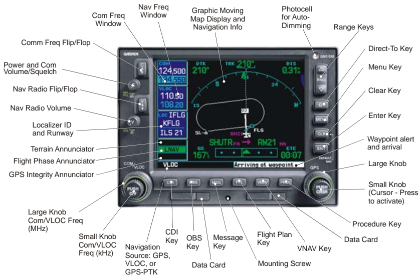
Figure 2 500W Series Control and Display Layout