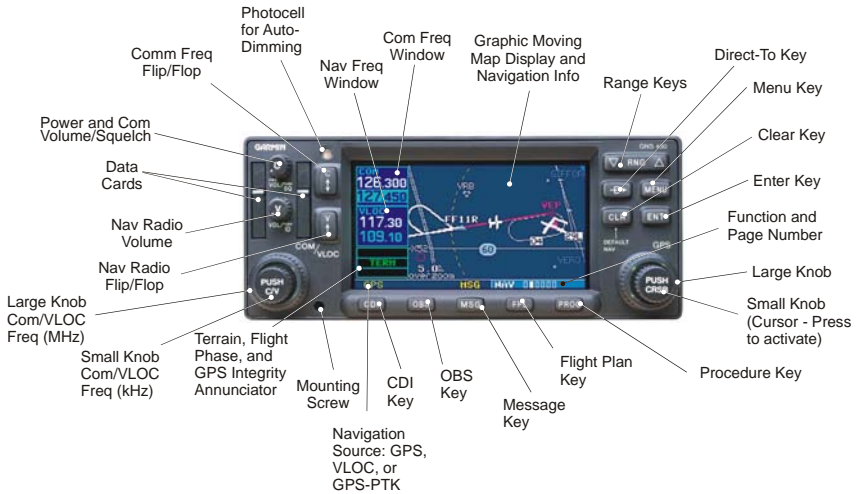
Figure 1 400W Series Control and Display Layout